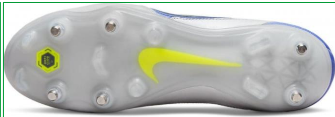
Metal Studs ✗

There will be toilets, and food and drinks vendors on site, and both general waste and recycling bins. Please respect the site and facilities and separate and recycle your waste using the bins provided.